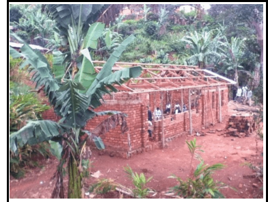
Mud brick church in Amani, Tanzania

and to praise Him in worship, most of these churches are not as nice as ours here in the United States. Compared to us, most Tanzanian families are very poor. Because they do not have much money, their church buildings are also more modest. Generally the churches are made with wood and tree bark or dried mud. Others are made