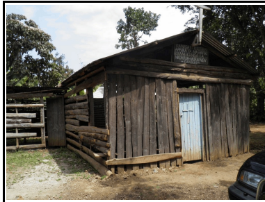
Wooden church in Usa River, Tanzania

But there are some differences. While they have churches where they go to gather with other believers to hear God's Word