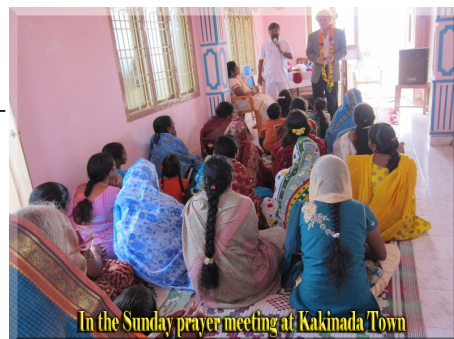
In the Sunday prayer meeting at Kakinada Town