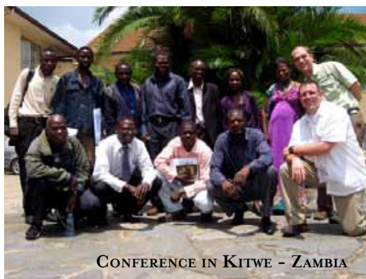
CONFERENCE IN KITWE - ZAMBIA

The Democratic Republic of Congo is a land of extreme