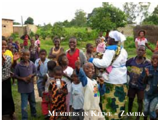
MEMBERS IN KITWE - ZAMBIA