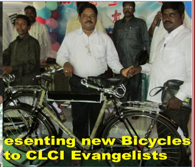
Presenting new Bicycles to CLCI Evangelists

acknowledge our CLCI pastors, evangelists, youth seminary students for their good work in doing this great work of CLCI evangelism. We are conducting outreach programs in every weekend. Even though it is becoming very difficult in doing outreach programs in India because of the opposition, still we are getting much calling for the new contacts in the tribal remote areas through our Evangelists and pastors.