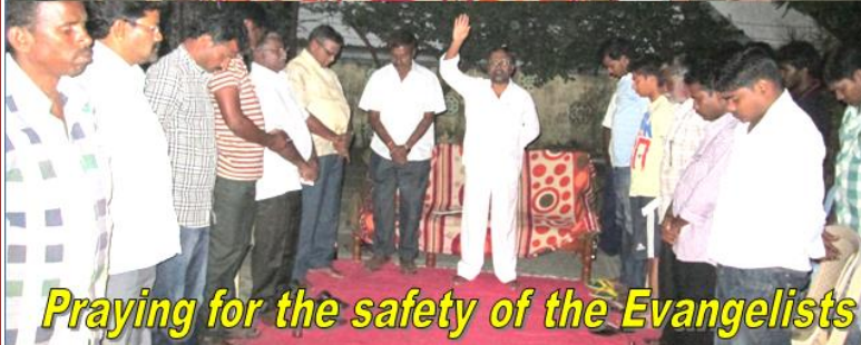
Praying for the safety of the Evangelists