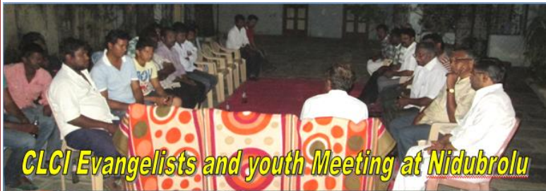
CLCI Evangelists and youth Meeting at Nidubrolu