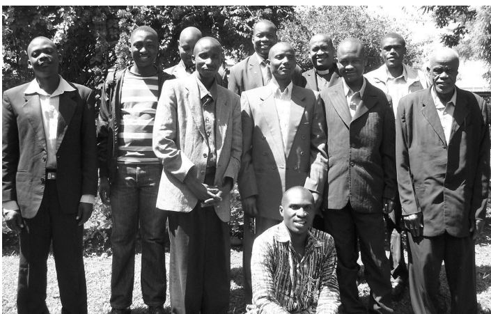
Pastoral Conference in Kisii, Kenya

The Kenya/Uganda joint pastoral conference was once again held in Kisii Town, Kenya with 12 men in attendance. Everyone was given an opportunity to take an exam on the fundamental teachings of the Lutheran faith. The results of the test showed a great deal of improvement from past years and renewed dedication to study that these servants of the Word have practiced over the last few years. During the second day of the conference everyone presented a sermon for the benefit of all the pastors and for the missionary to have an opportunity to give input and critique their presentation of the Word. The final day of the conference was reserved for the planning session of the ongoing work in Kenya/Uganda. The leaders of these respective church bodies formulated short-term and long-term goals and implementation of a plan to accomplish those goals. We were blessed with safe travels and a wonderful time of fellowship and unity for those three days.