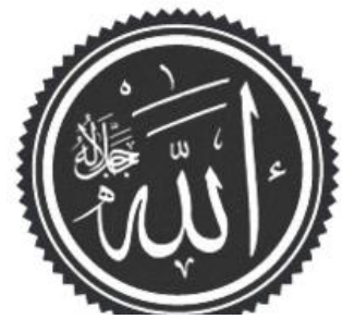
Symbol of Islam

Today in Tanzania there is a great struggle going on between our Christian religion and the false religion of Islam. The old native religions are not practiced much anymore. The devil tries another approach then of bringing in a religion that tries to rival our Christian faith. When Paul preached on the island of Cyprus there was a Jewish false prophet, a certain magician who was trying to win the Roman proconsul, Sergius Paulus, to his wicked ways. Paul was trying to win Sergius to the Christian faith. The result finally was "the proconsul believed." Acts 13:12