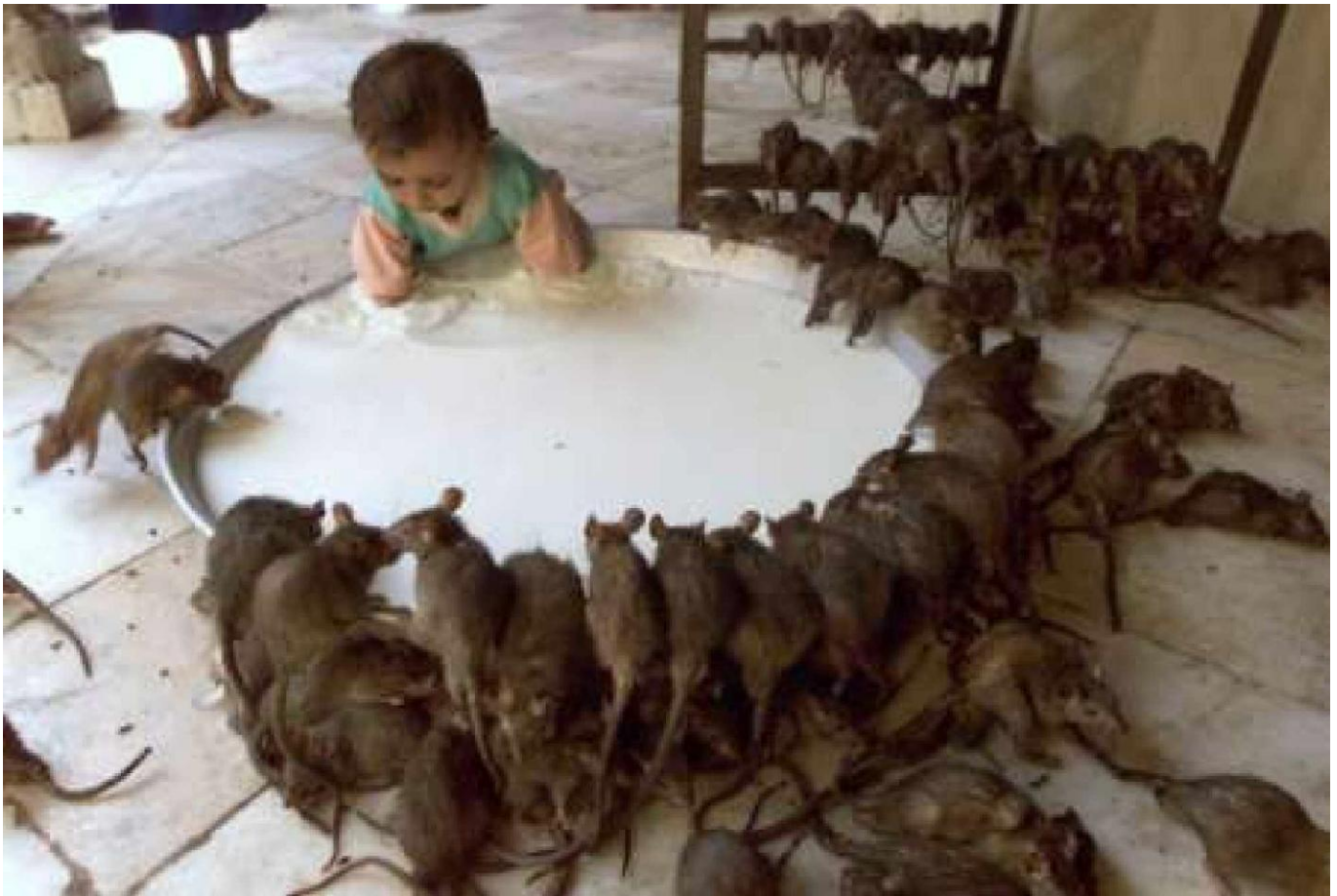
Rats are seen as sacred in Hinduism. In this temple, milk and grain are fed to the rats, and then people eat and drink from the same milk and grain as part of their worship. It is considered a blessing from the Hindu god, Ganesh, to eat what a rat has touched. The god, Ganesh, is said to have ridden on a rat, making it a sacred animal.