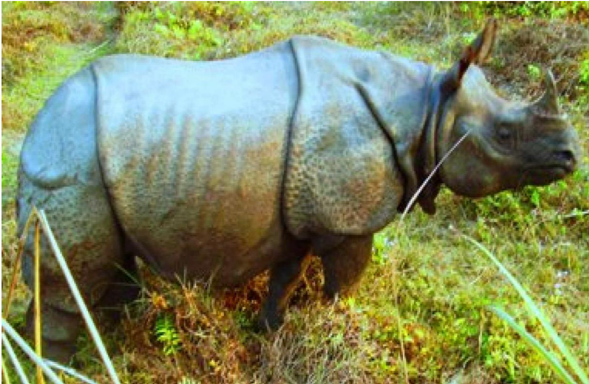
The one-horned rhinoceros lives primarily in northern India and Nepal. Their segmented hide looks like a coat of armor. This mammal is a plant-eater (herbivore) and can live up to 40 years. These rhinos grow to about 12.5 ft. long, 6 ft. high, and up to 6000 lbs. They are on the endangered species list.