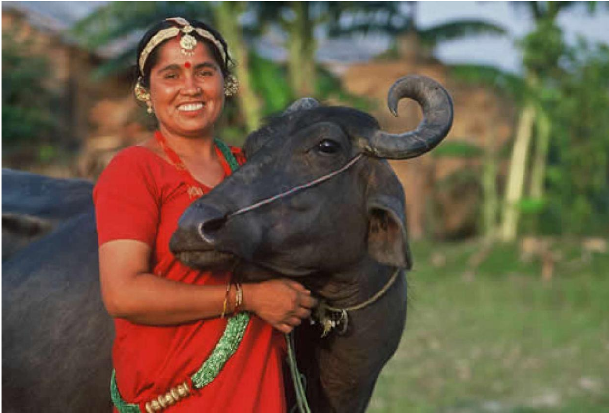
Water Buffalo are a type of cow that is very common in Nepal. They are used to pull plows for planting fields and they give milk for a family to drink, but it is against Hindu law to kill these animals or any type of cow.